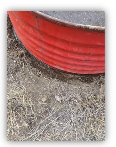
Image 5. Seepage of 1-2" outside the cylinders was not considered significant.

Also considered insignificant were other factors, such as minor spillage from the fill buckets, the amount of vegetation present at each test site, the rock content of the soil below each test site, and the ever-changing weather effects on the rate of evaporation throughout the data collection period.