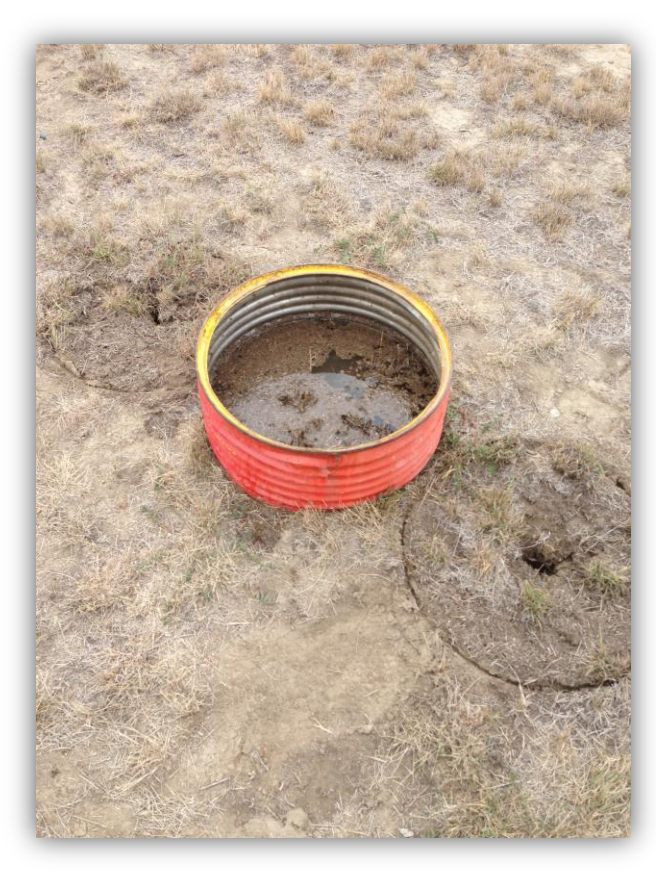
Image 7. Absorption test being conducted between probe sites that were tested the day before. Note that there is no probe hole under the water in the cylinder. Absorption rate values for these in-between sites were similar to those of the Control Group in this test, suggesting that in this particualr soil, it would be ideal to fracture every 2 feet, rather than every 4. In soils of less compaction and greater moisture, however, distances of over 4 feet may well be adequate.

For the purpose of gathering an estimate of efficiency, therefore, the probing span of 4 feet between holes seems reasonable. In this case, a row crop, such as in an orchard or vineyard (where roots are deeper than with crops such as wheat or hay), could be treated at a rate of 400 row feet in 50 to 130 minutes, depending