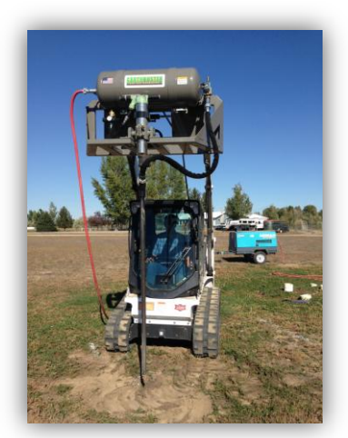
Image 1. EarthBuster device mounted on a skid-steer with air compressor in background.

The design of the experiment called for two groups of test sites, a Control Group, and Experimental Group. The two groups were in close proximity to one another, under the assumption that underlying soil conditions would be as similar as possible. The Control Group consisted of 10 absorption test sites, spaced at 4 feet on center, along a straight line. For the Control Group row, no pneumatic fracturing done. was Meanwhile, the Experimental Group absorption test sites were laid out in identical fashion to the Control Group, with the Experimental Group site being parallel